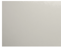
Smooth White | 85