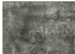
Concrete Finish | Designs